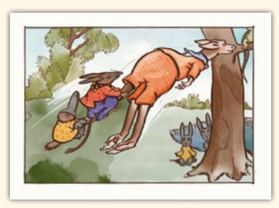
He dashed along, sprang through the air. and in two twinklings, they were there!

every week for 43 years! The half-page strip featuring her signature cheeky Gumnut Babies is still one of the longest-running comic strips in Australia to be continuously produced by one single artist.