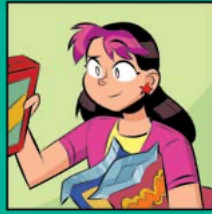
CLAUDIA KISHI VICE PRESIDENT