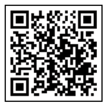
Book Fair Payment

Make a secure payment online by going to scholastic.com.au/payment or scanning the barcode below.